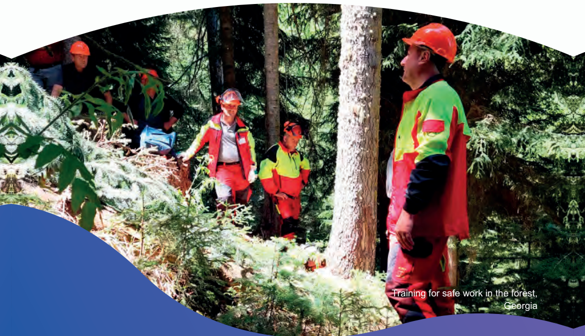
Training for safe work in the forest. Georgia

Centre for International Cooperation and Development Kardeljeva ploščad 1 1000 Ljubljana Slovenia website: www.cmsr.si tel.: + 386 1 235 07 80 e-mail: info@cmsr.si Tax no: SI91841917