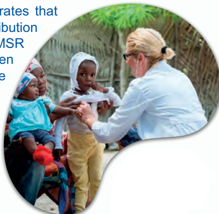
Ensuring medical equipment in Kenya

Through its projects, CMSR demonstrates that Slovenia can make a meaningful contribution to solving global challenges. CMSR is currently active in more than ten development projects across Europe and Africa, where it promotes Slovenian expertise and innovation.